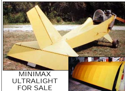
MINIMAX ULTRALIGHT FOR SALE